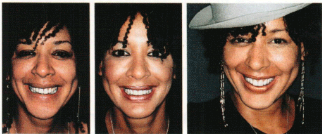
Vive la difference: (Left to right) Bad—the before; better—during, after gum surgery and in the temporary veneers; best—after, the stellar final results