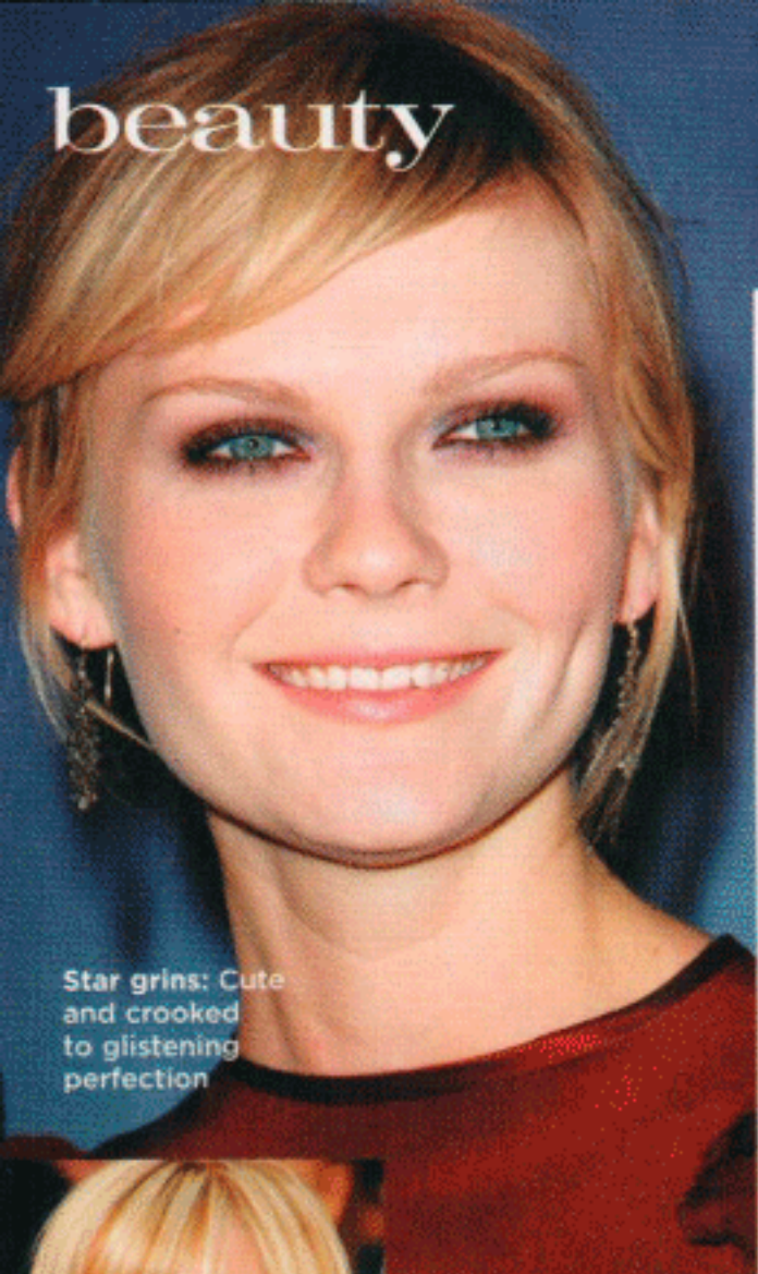
Star grins: Cute and crooked to glistening perfection